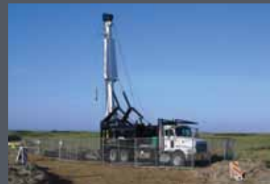
Well Development & Rehabilitation